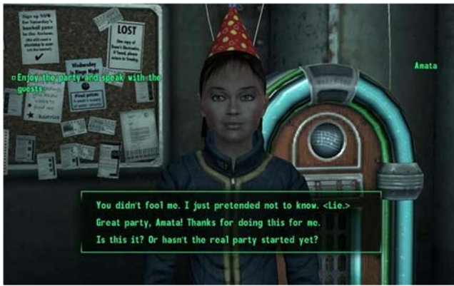
Figure 1: Conversation in Fallout 3 .

We chose the game Fallout 3 for our experiment for five reasons: (1) it is a popular, recently-released, commercial video game; (2) it uses a first-person perspective and realistic character models, which stimulate immersion; (3) it allows the expression of a variety of player preferences through conversation, action, and unconscious behavior; (4) its opening sequence, used in the experiment, is mostly story-driven with little violence; and (5) a toolset for the game has been released that allowed us to change the game to automatically record player decisions and actions.