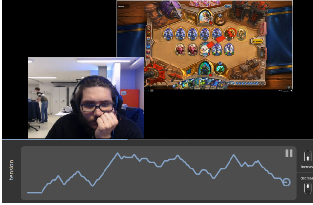
Figure 2: A snapshot of third-person tension annotation using the PAGAN RankTrace annotation method.