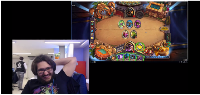
Figure 1: Snapshot of a video recording. Webcam feed is captured at the bottom left and game screen is captured at the top right of the recording video file.